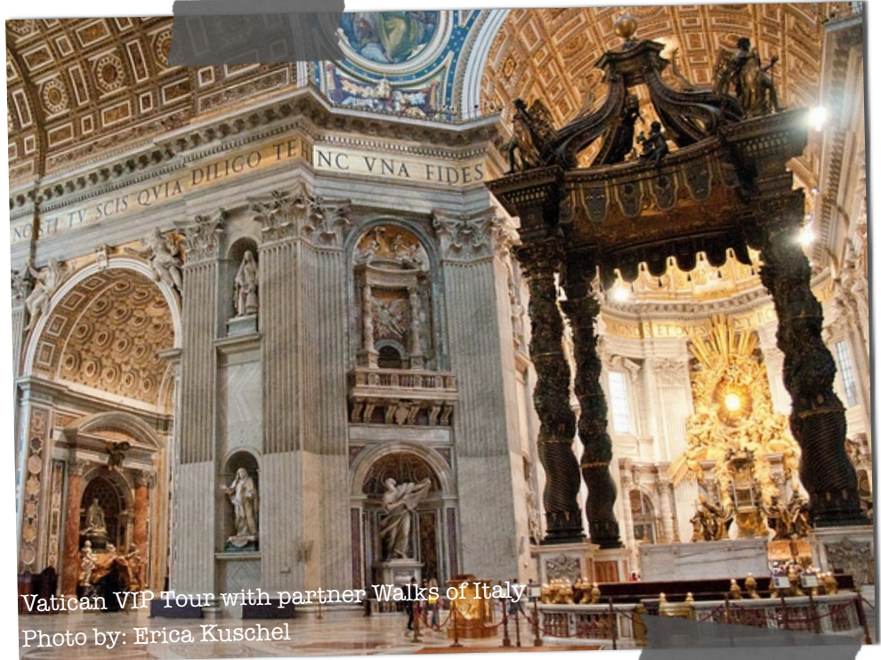
Vatican VIP Tour with partner Walks of Italy